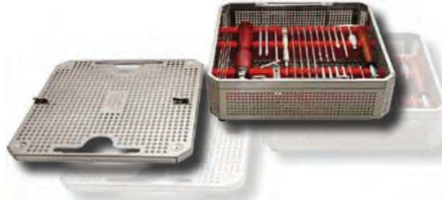
TRAY-LO-0010-021 Tray for Fusion Lock Small Fragment Instrument SET-LO-0010-021